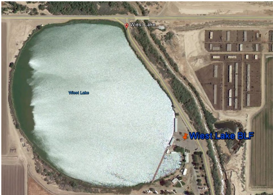
Wiest Lake

The hot season at Wiest Lake lasts from June to September. July is the hottest month of the year in Brawley, with an average high of 107°F. Due to the extreme summer heat, the BLF's shade structures (ramadas) are the central gathering place for boaters. Boaters beach their boats under the ramadas or anchor offshore while they picnic and lounge at the shaded water's edge.