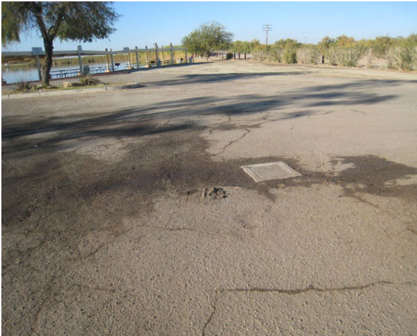
Existing Parking Area and Proposed Expansion